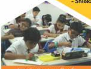
Imagination is reality of the dreams - Collage Making