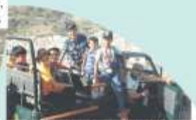
Enjoying Good friends, Good food, Good time