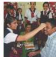
Giving love is the highest pleasure