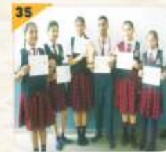
35. Classes IX - X, Bharat Vikas Patriotic Song Singing Competition, III Prize