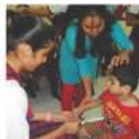
Happiness is in your ability to give happiness to others

Selected girls visited BPA and tied Rakhies to the Physically challenged children and offered sweets to them which made the occasion auspicious and sentimental.