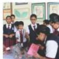
We have two hands, one to help ourselves the second to help others

The School organised special exhibition cum Rakhi Sale where girls of Andh Kanya Prakash Gruh exhibited hand-made Rakhis for sale at the School Campus. Students were encouraged to take part in this noble cause and overwhelming response was witnessed.