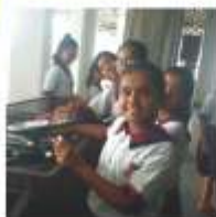
Seva is just an expression of our inner love