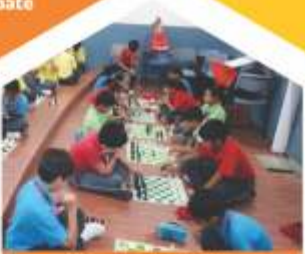
Chess is a gymnasium of mind - Chess