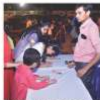
Your greatness is not what you have, it's what you give