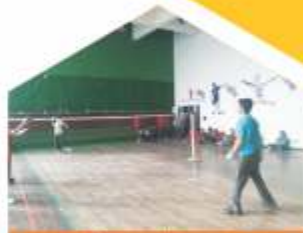
One smart smash can make you win the game - Badminton