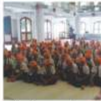
God is everywhere so pray anywhere