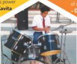
Music speaks when words fail - Solo Instrumental