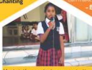
Music is the greatest communication in the world. - Patriotic Song