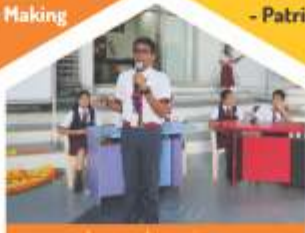
I am not arguing, I am putting forward my opinion - Debate