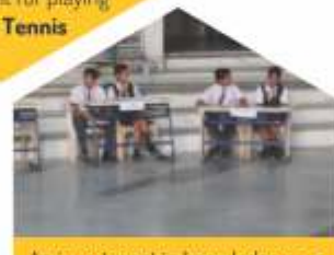
An investment in knowledge pays the best interest - Quiz