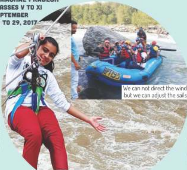
We can not direct the wind, but we can adjust the sails

Adventure, not only provide fun and entertainment, it is a positive add-on to one's learning. An adventure camp to Manali had been planned by Shanti Asiatic Sports Academy in collaboration with Aarohi Adventure for students.