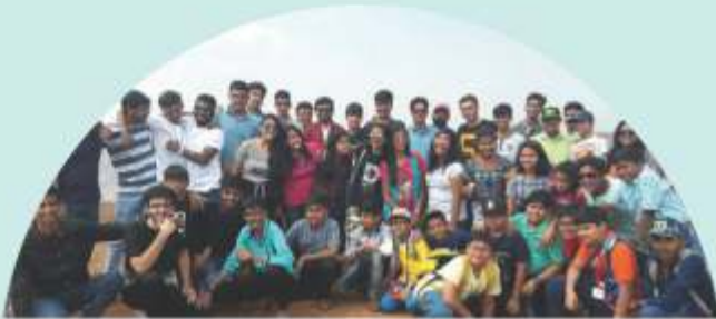
Individually we are one drop but together we are an Ocean