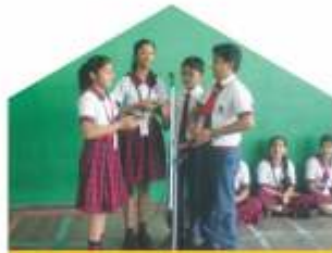
Music is a prayer the heart sings - Shloka Chanting