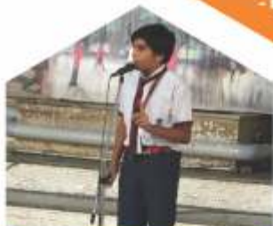
My speech is power - Hasya Kavita