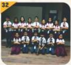
32. Classes I - XII, Rock your Feet Dance Competition, II Prize