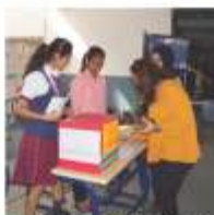
Giving is not just about making a donation, it's about making a difference