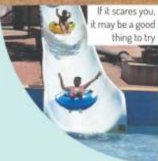
If it scares you, it may be a good thing to try

The Table top point at Panchagani and Mapro Garden was another highlight of the trip.