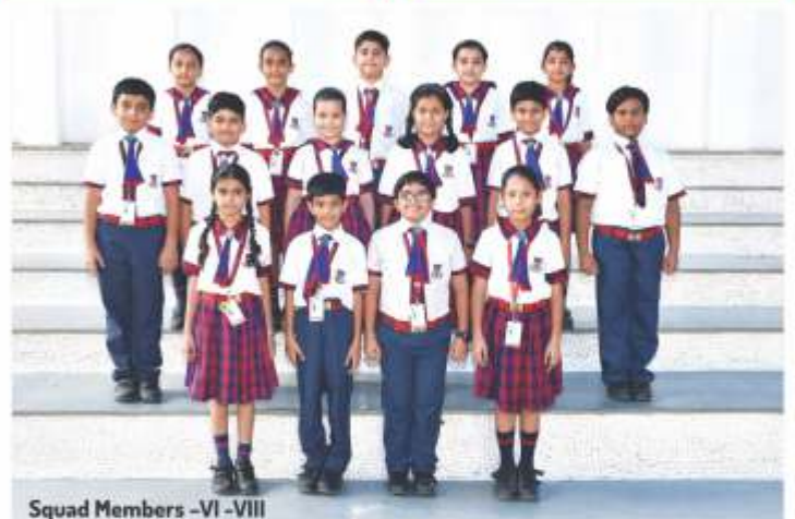
Squad Members -VI -VIII