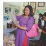
Shopping for a noble cause...