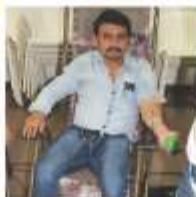
Every blood donor is a life saver