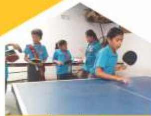
Some days are simply meant for playing - Table Tennis