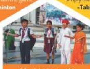
Advertising is a wonder - Hindi Vigyan